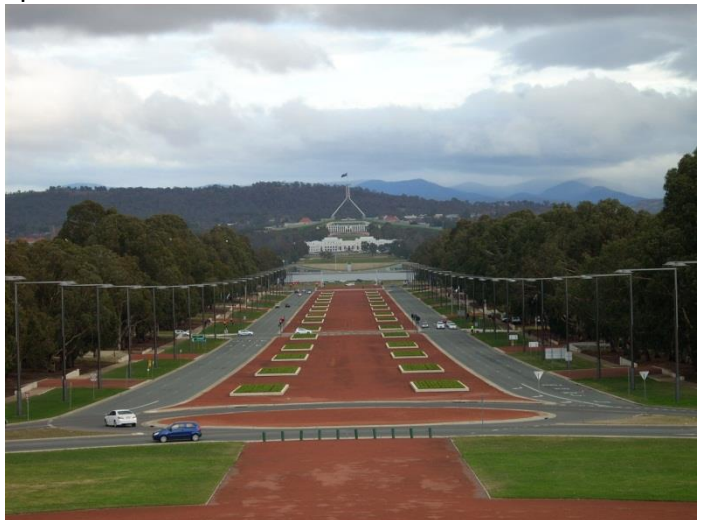
The War Memorial was spectacular