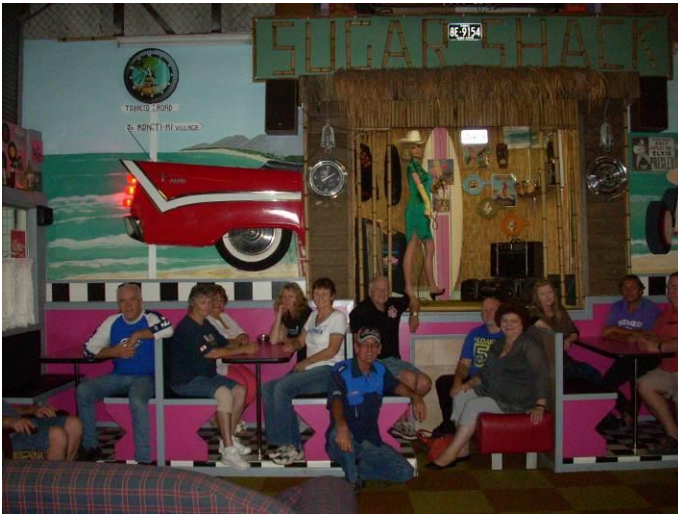
Some of us in the diner

The museum is not actually open to the public as yet but the owners allowed us a sneak peek before it opens in the new year as a fully functional 50s milk bar and diner.