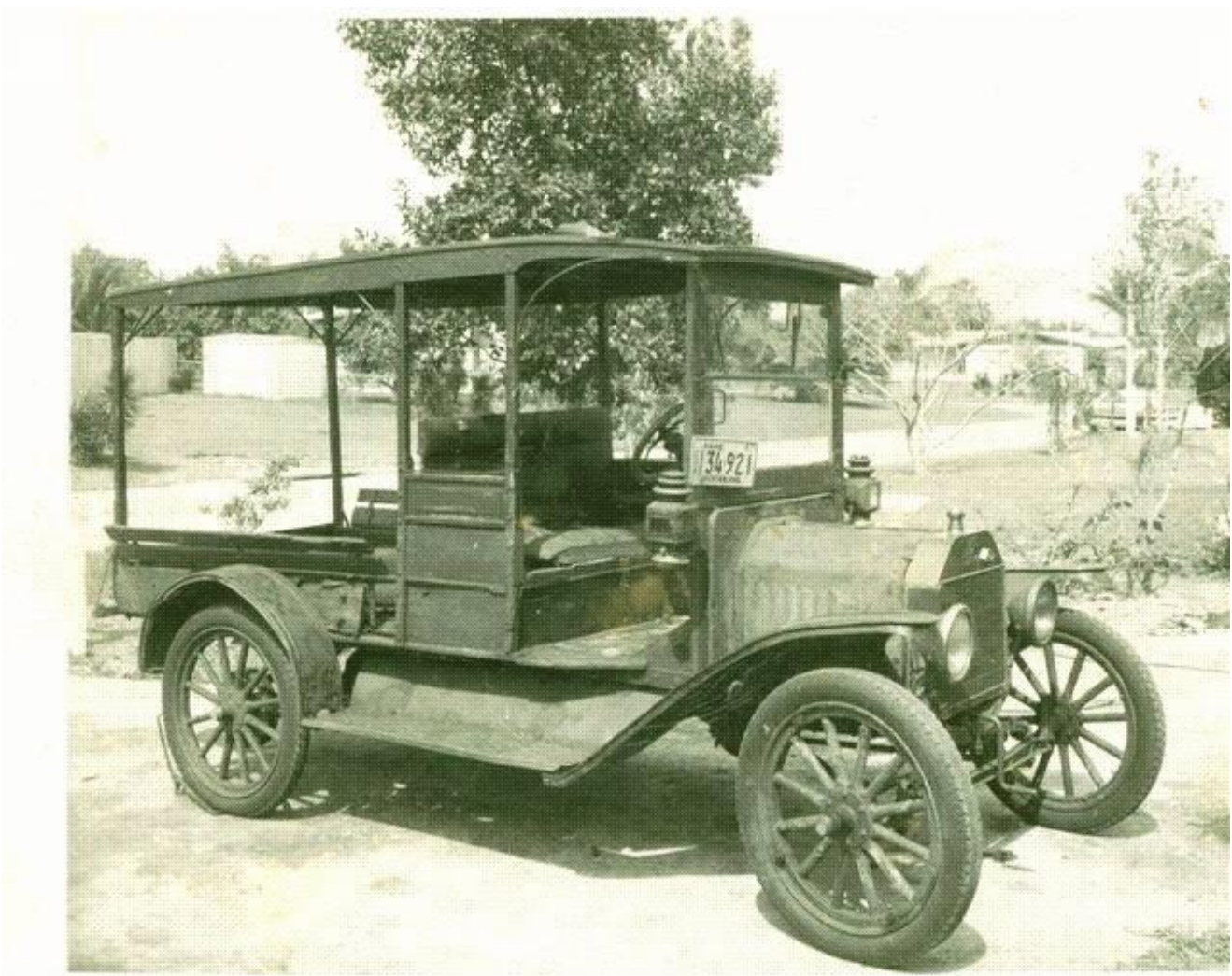
1914 Model T Ford Station Wagon.

May 31, 1927, the last Ford Model T rolled off the assembly line. It was the first affordable automobile, due in part to the assembly line process developed by Henry Ford. It had 2.9-liter, 20-horsepower engine and could travel at speeds up to 45 miles per hour. It had a 10-gallon fuel tank and could run on kerosene, petrol, or ethanol, but it couldn't drive uphill if the tank was low, because there was no fuel pump; people got around this design flaw by driving up hills in reverse. Ford believed that "the man who will use his skill and constructive imagination to see how much he can give for a dollar, instead of how little he can give for a dollar, is bound to succeed." The Model T cost $850 in 1909, and as efficiency in production increased, the price dropped. By 1927, you could get a Model T for $290. "I will build a car for the great multitude," said Ford. "It will be large enough for the family, but small enough for the individual to run and care for. It will be constructed of the best materials, by the best men to be hired, after the simplest designs that modern engineering can devise. But it will be low in price that no man making a good salary will be unable to own one - and enjoy with his family the blessing of hours of pleasure in God's great open spaces."