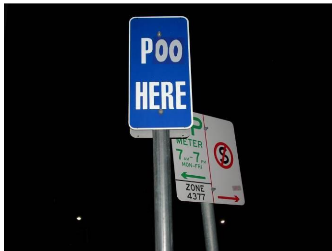
This sign was spotted in the city. Some-one has a strange sense of humour.